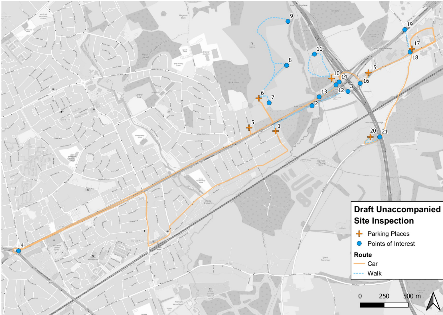
Figure 2.1 – Suggested site inspection route and points of interest